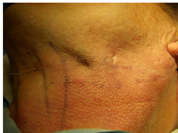
Figure 4. The Silhouette suture is pulled taut in a superolateral direction manually to note the proper placement of thread. Note: The adjacent scar is unrelated to the procedure.

It is important to note that the proximal end of the Silhouette suture has a curved needle end that is used to puncture a suture mesh. At this time, the curved needle end of the suture is passed through the fascia, passed again through the fascia in the opposite direction, and then tied to itself. This, in turn, is tied down and fastened to the underlying subauricular