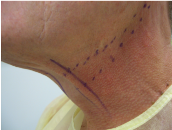
Figure 2. Markings on the patient in an upright position.

A #11 blade is used to make a nick incision in this vicinity through which the tumescent anesthetic solution is introduced. The tumescent solution consists of 0.1% lidocaine with 1:1,000,000 epinephrine in a lactated Ringer's solution. A submental nick incision is only used if neck and jowl liposuction are going to be concomitantly performed using the resuspension technique. Hydrodissection is performed in the subcutaneous plane above the SMAS, with the assistance of a showerhead infusion cannula attached to a 60-mL syringe. Metzenbaum scissors or a 4-mm spatula liposuction cannula is used for minimal and blunt undermining at the supra-SMAS level. Blunt dissection is further performed by extending anteri-