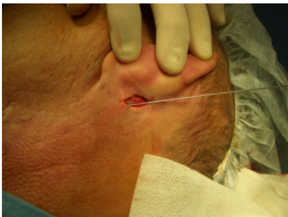
Figure 3. Incision in the posterior auricular sulcus through which the Silhouette suture is introduced.

A #11 blade is used to make a nick incision in this vicinity through which the tumescent anesthetic solution is introduced. The tumescent solution consists of 0.1% lidocaine with 1:1,000,000 epinephrine in a lactated Ringer's solution. A submental nick incision is only used if neck and jowl liposuction are going to be concomitantly performed using the resuspension technique. Hydrodissection is performed in the subcutaneous plane above the SMAS, with the assistance of a showerhead infusion cannula attached to a 60-mL syringe. Metzenbaum scissors or a 4-mm spatula liposuction cannula is used for minimal and blunt undermining at the supra-SMAS level. Blunt dissection is further performed by extending anteri-