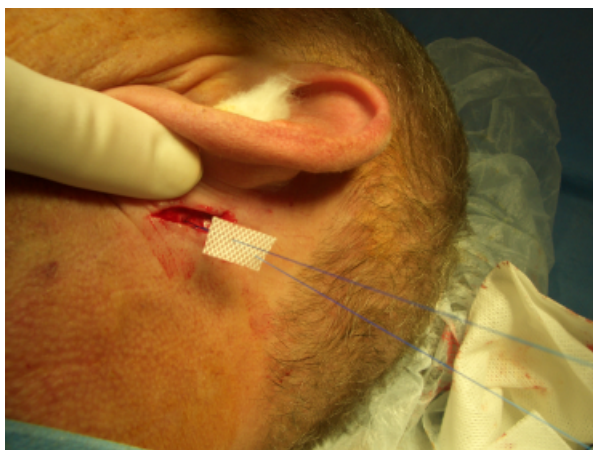
Figure 5. The proximal end of the Silhouette suture is inserted through the mesh with the aid of the curved needle end. The sutures are then fastened to the underlying fascia.

No infection or knot abscesses have been observed. We have followed our patients for 6 months postoperatively and have found that they have retained sharp jawline definition and cervical mental angle positioning throughout this time period. We plan to follow these patients to observe the long-term efficacy of this modality.