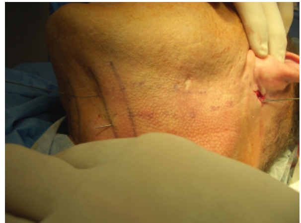
Figure 6. More than one Silhouette suture may be deployed at least 1 cm apart from one another.

Besides having the expected localized ecchymoses, edema, and tenderness, one patient had a sensory