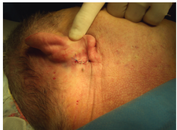
Figure 7. The overlying incision is sutured with 5-0 prolene.